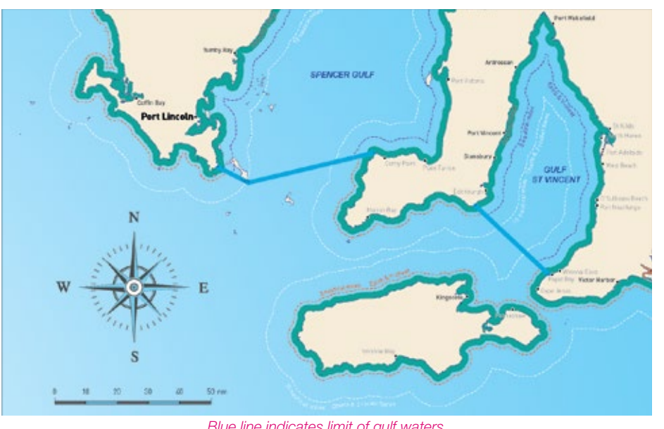
Blue line indicates limit of gulf waters