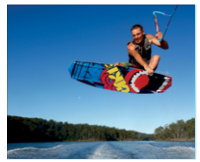
A person being towed by a vessel in any way must wear an approved lifejacket level 50 or 50S at all times.

Note: Australian Standard AS 4758.1:2022 incorporates all of the former approved Australian standards. Some European, Canadian and New Zealand standards comply. Older lifejackets that meet Australian Standards AS 1499, AS 2260 and AS 1512 cannot be used from 1 January, 2025.