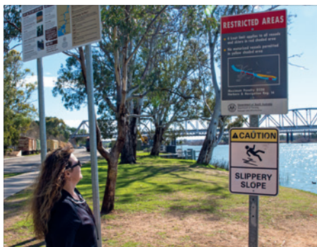
Boating on the River Murray demands special care

The rules that apply to boating on the River Murray are essentially the same as those for other navigable waters. However, additional rules under the River Murray Traffic Regulations that specifically apply to bridges, ferries and locks on the River Murray are incorporated into the Harbors & Navigation Regulations 2009 and are outlined below.