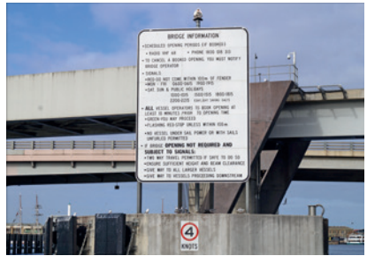
A four knot speed limit applies within 100 m either side of all Port River Bridges.

6:00 am to 6:15 am and 7:00 am to 7:15 pm.