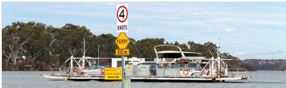
A four knot ferry crossing.